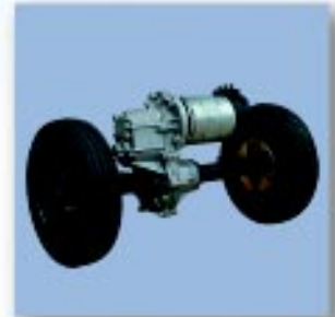
Superior drive The unique design of the drive axle offers an exceptional traction and braking performance.