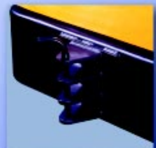
Flexible tow coupling A multistage tow coupling provided at the rear enables trouble free coupling.

CE Manufactured in conformity with the provisions in the COUNCIL DIRECTIVE 98/37/CEE and all harmonized EN standards.