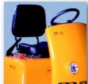
Ergonomic construction Adjustable seat, enhanced visibility and good driving comfort ensure high driver efficiency.