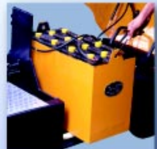
Quick battery change Standard battery rollers facilitate quick and effortless replacements.